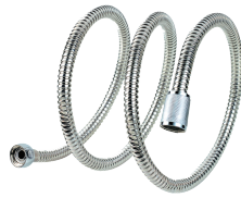
B. 150 cm stainless steel hose