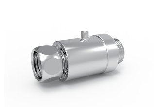
C. Air-In Valve