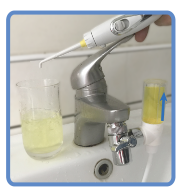
The Switch of Water Diverter Leftward: Water sprays out from Oral Irrigator.