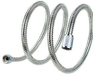
B. 150 cm stainless steel hose