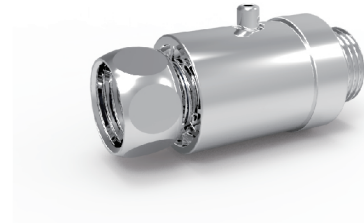
C. Anion handshower kit