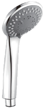
A. Multifunction handshower